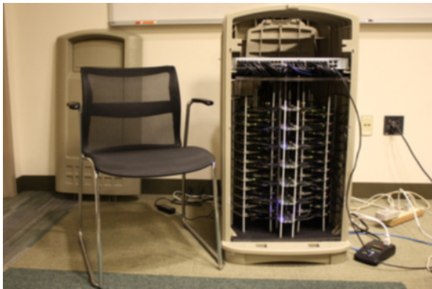
Figure 1. TI PandaBoard cluster used for experiments

Figure 1 provides a view of the TI PandaBoard cluster, along with a chair placed beside it in order to show the scale.